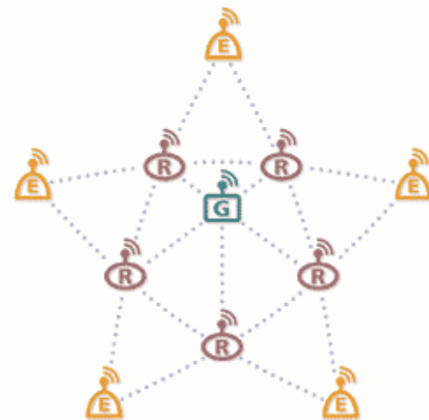
Figure 3. Star-Mesh SOWSN combines a mesh of routers (to extend coverage and route around obstacles) with star endpoints. A Star-Mesh topology combines the benefits of multi-hopping to provide extended reach and fault tolerance with ultra-low power sensor endpoints.

A star-mesh hybrid (Figure 3) seeks to take advantage of the low power and simplicity of the star topology, as well as the extended range and self-healing nature of a mesh network topology. A star-mesh hybrid organizes sensor nodes in a star topology around routers or repeaters which, in turn, organize themselves in a mesh network. The routers serve both to extend the range of the network and to provide fault tolerance. Since wireless sensor nodes can communicate with multiple routers, the network reconfigures itself around the remaining routers if one fails or if a radio link experiences interference. A star-mesh network